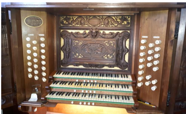
The organ console at St Nicholas, Tolleshunt D'Arcy

Once your application has been processed we will send you a Gift Aid Declaration (if applicable) and a GDPR Consent Form, to be completed and returned at your earliest convenience.